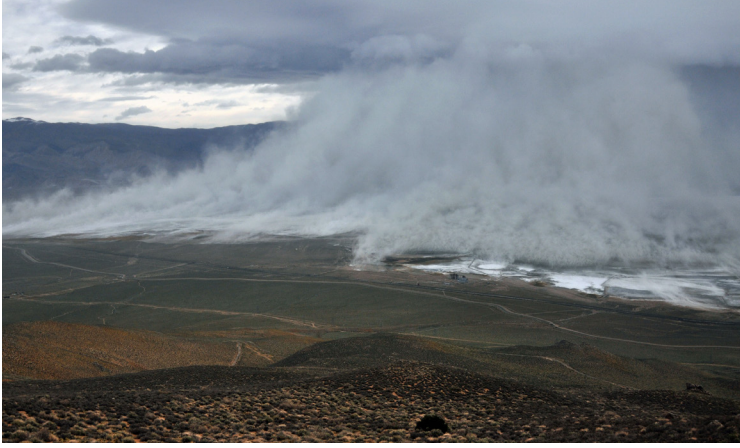
A severe dust storm at Owens Lake currently known as Owens Dry Lake . This went dry as a result of water diversion to L.A. It also led to a Clean Air Act lawsuit which resulted in LA having to mitigate dust. Over $1 billion was spent in mitigation efforts