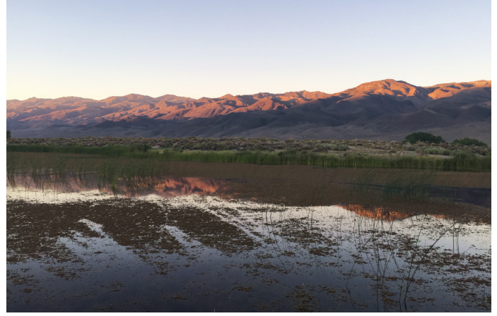
The Place of Flowing Water, what our people call, Payahuunadu. Wetland in Bishop, CA.

Our stories also reveal important people in the management and oversight of water in the region, like the Pa:hy:ta:kod:zo:va:ah (the man that ruled the water or ocean) and Pa-ya-ta-ca-ioa (one who cares for the water). Both were watchmen of the water, just as a watchman watches a dam. In our culture we had water irrigators and water managers who held high positions in our society and were very well respected. This is because water is life, or in our language, Paya-ii tuihiimüna ahoko adütsüngüna.