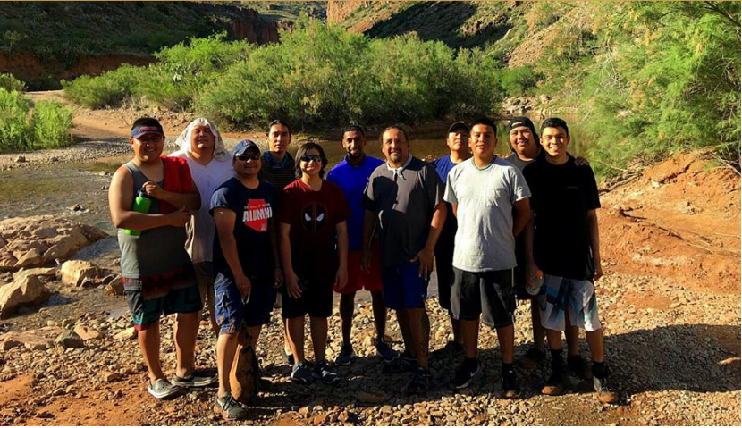
Salt River Canyon rafting trip Who's That? Page 27