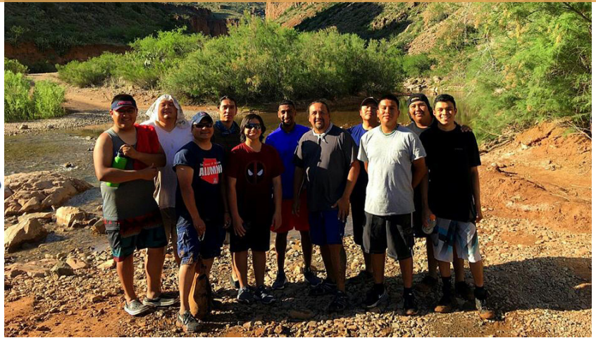
Salt River Canyon rafting trip Who's That? Page 27

Understanding Refresh Share Place Support Community Connect Overcome Express Motivating Rejuvenating Heal Guidance Safe Strong