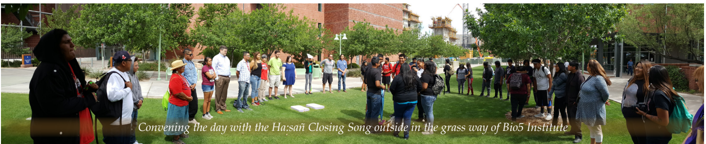
Convening the day with the Ha:sañ Closing Song outside in the grass way of Bio5 Institute