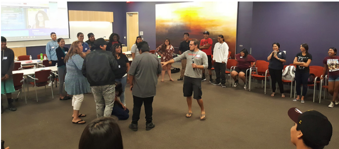
Ha:sañ youth enjoying an elimination game

The Southwest Environmental Health Sciences Center (SWEHSC) is a part of a variety of communities and organizations, which influences native youth through higher education and culture. In May 2017, SWEHSC staff members worked on contributing a full day of activities and workshops for Ha:sañ Preparatory and Leadership School students and faculty. Thirty-five high school students ranging between ninth to twelfth grade came together to engage with professors, staff, and student at the Ha:sañ Environmental Health Science Conference.