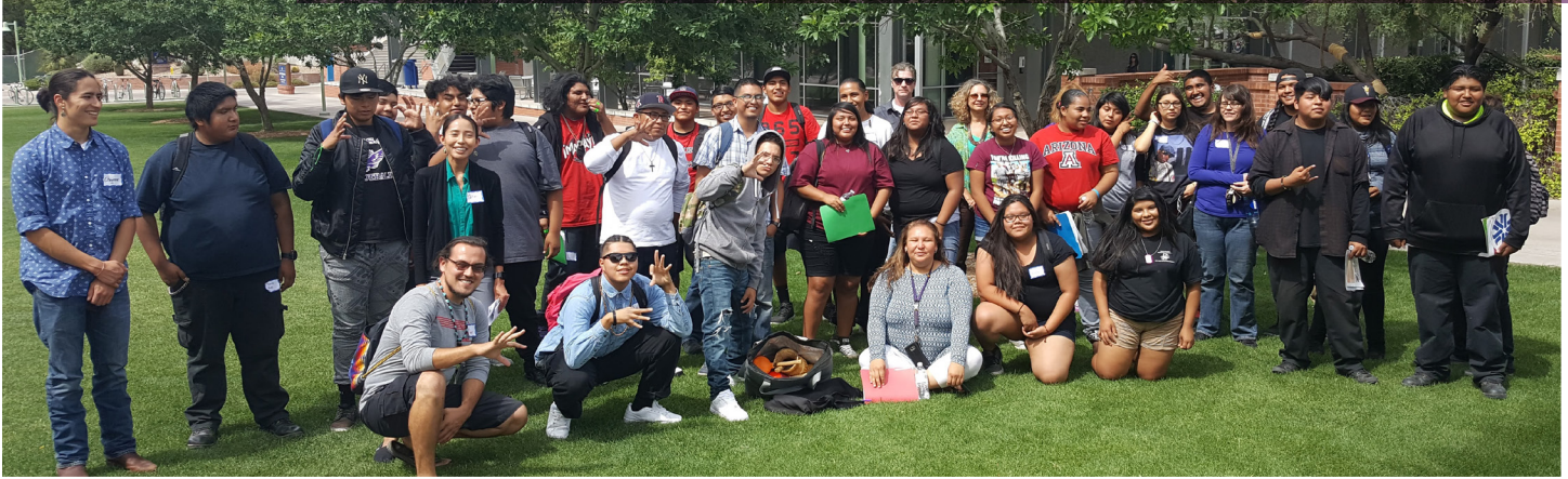
Who's that? Page 27

The Southwest Environmental Health Sciences Center (SWEHSC) is a part of a variety of communities and organizations, which influences native youth through higher education and culture. In May 2017, SWEHSC staff members worked on contributing a full day of activities and workshops for Ha:sañ Preparatory and Leadership School students and faculty. Thirty-five high school students ranging between ninth to twelfth grade came together to engage with professors, staff, and student at the Ha:sañ Environmental Health Science Conference.