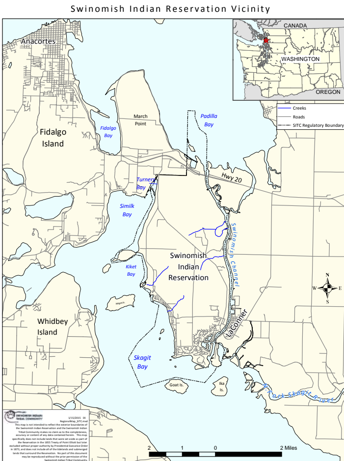
Swinomish Indian Tribal Community regional map

After the interviews, a series of workshops utilized interactive PowerPoint presentations that allowed stories and meanings to be described using real-time software, with responses available immediately on the screen for discussion. The response software allowed anonymous responses, which would prevent any tensions from building due to the small community size.