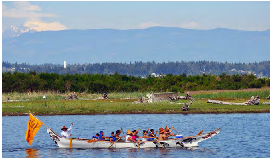
The Salmon Dancer Canoe Family paddles along the shorelines of Swinomish.

As one of the tribal members involved in the interviews, Larry found it helpful to incorporate the Swinomish traditional lifestyle into the health of its tribal members. “Describing how various ceremonies and laws govern the fishermen, the hunters, how generosity is exhibited by these individuals by sharing their first catch with the elders who cannot go out and hunt on their own. These traditions are done for good luck and for good luck with hunting. The traditional foods of the Swinomish have a deep spiritual meaning and provide food for the spirit. At each gathering, traditional foods are always made