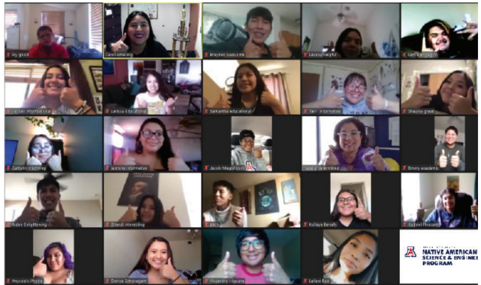
The 2020 NASEP cohort was held entirely through Zoom

The Native American Science and Engineering Program (NASEP) is a year-long program that offers STEM engagement throughout the academic year. Each group is seen as a cohort and will receive support from NASEP staff as they prepare to apply to college. Additionally, there are other events offered throughout the year that consists of 4 phases: summer session, research project, enrichment, and closing. As COVID-19 put a hold on gatherings, academics, leisure, and other aspects of life, NASEP also had to adjust its normal programming to ensure the safety and wellbeing of