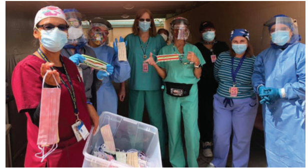
Gallup Indian Medical Center healthcare staff handing out the donated masks to patients and those being tested for COVID-19

As much as the COVID-19 pandemic will be associated with the year 2020, so will volunteerism and the big hearts that have led many to help others locally and on their homelands. This year we have seen the rise of numerous COVID-19 relief efforts, providing food, water, cleaning supplies, and assistance to family, friends and tribal members. The majority of relief efforts for Native and Indigenous communities have been targeted towards helping reservation communities. Indigenous Volunteers' efforts to help those living on reservations included organizing ongoing mask drives for the Hopi reservation and for Gallup Indian Medical Center, located on the Navajo reservation.