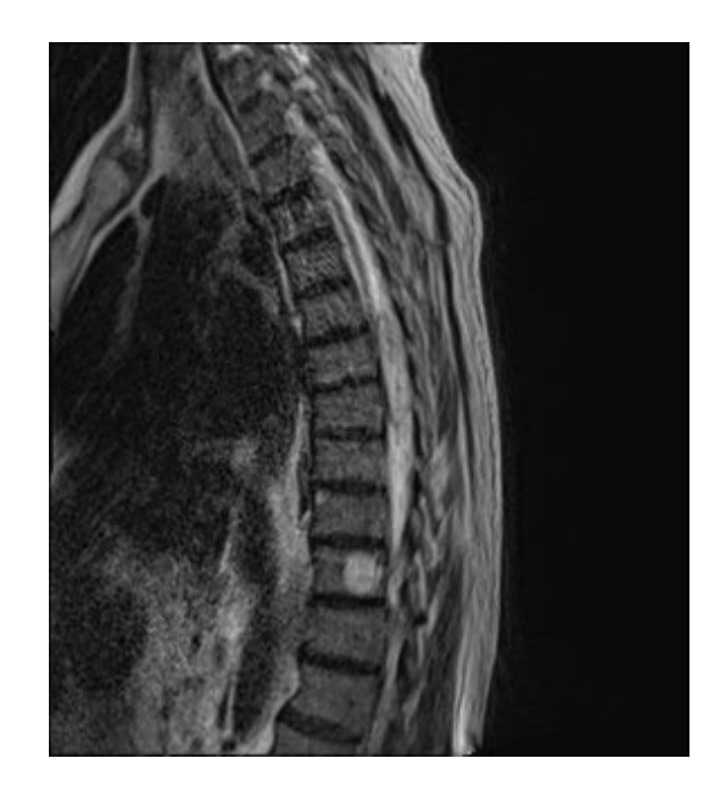
Figure 1: MRI of the spine shows an epidural mass.

Resection of the T7 epidural spinal mass demonstrated prominent vascular proliferation with an atypical large cell infiltrate exclusively within the lumens of small and intermediate sized vessels (Figure 2). The large cells have irregular nuclei, vesicular chromatin, occasional prominent nucleoli, and