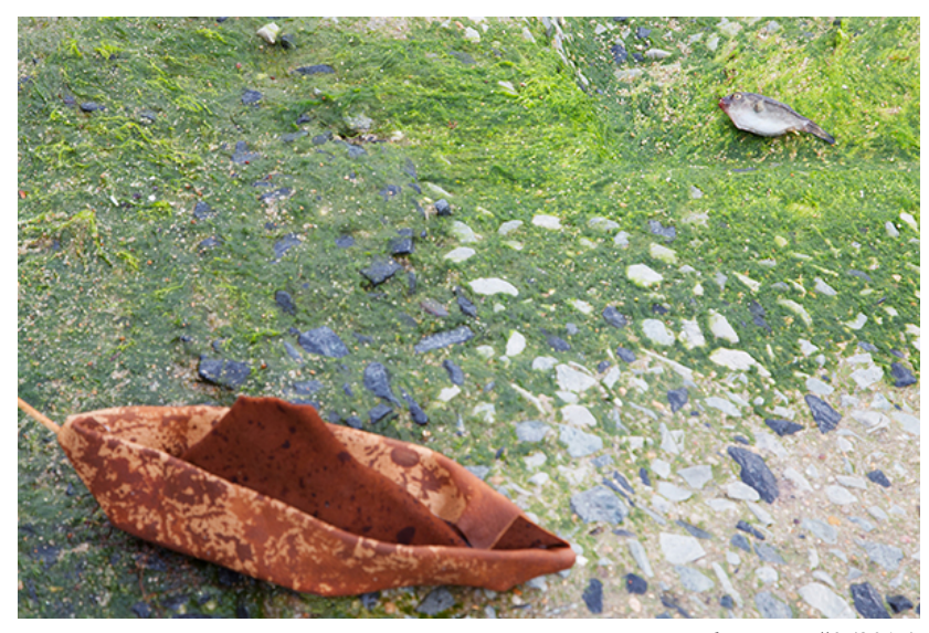
BOAT JOURNEY: In transition, Nha Trang #3 (2015)

A dual tension of the impossibility of full assimilation in a new land and the difficulty of returning and reintegrating in one's own culture gave Nguyen the idea for Boat Journey , an ongoing photographic project, which focuses on a quest for a place where we, immigrants, seek to belong. A figure dressed in traditional Vietnamese tunic and pant, áo dài , holds onto a small makeshift leather boat. This boat is a ticket, a passport to escape. However, it gets stuck on the land and can never be set free. This project is as relevant today, as millions of migrants flee their homeland in attempts to resettle in Europe from war-torn Syria and Iraq, as it was then when flocks of Vietnamese exiles sought refuge from the American War in the late 1970s.