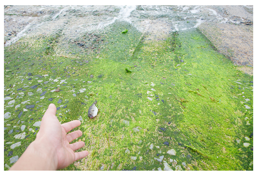
BOAT JOURNEY : In transition, Nha Trang #1 (2015)