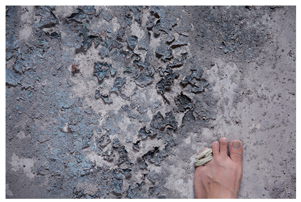
BOAT JOURNEY : In transition, Tan Tan Theatre #1 (2017)