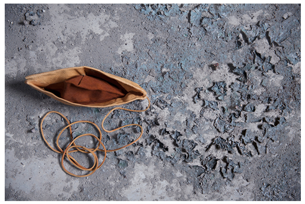
BOAT JOURNEY : In transition, Tan Tan Theatre #2 (2017)