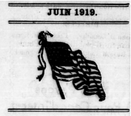
La Fête Saint-Jean-Baptiste et Nos Soldats.

Article from Le Courrier du Michigan, 1919 (Published in Lake Linden, Michigan)