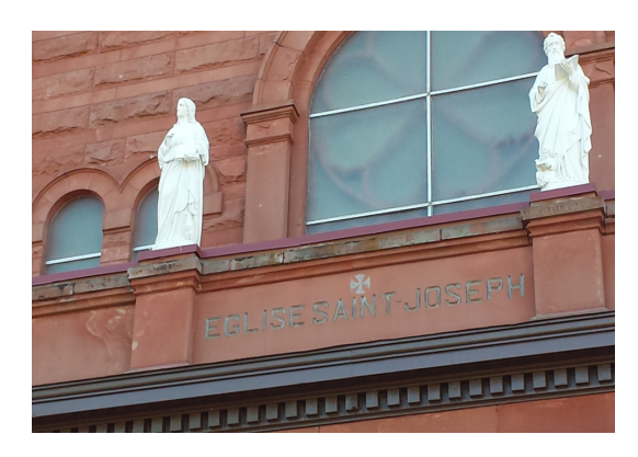
Figure 2a. St Joseph's Catholic church in Lake Linden with the name Église Saint-Joseph [St. Joseph's Church] carved in its stone facade.

Superior. French Canadians were among the laborers, but like in the north, they occupied a variety of roles created by the economic development (Truckey 2014).