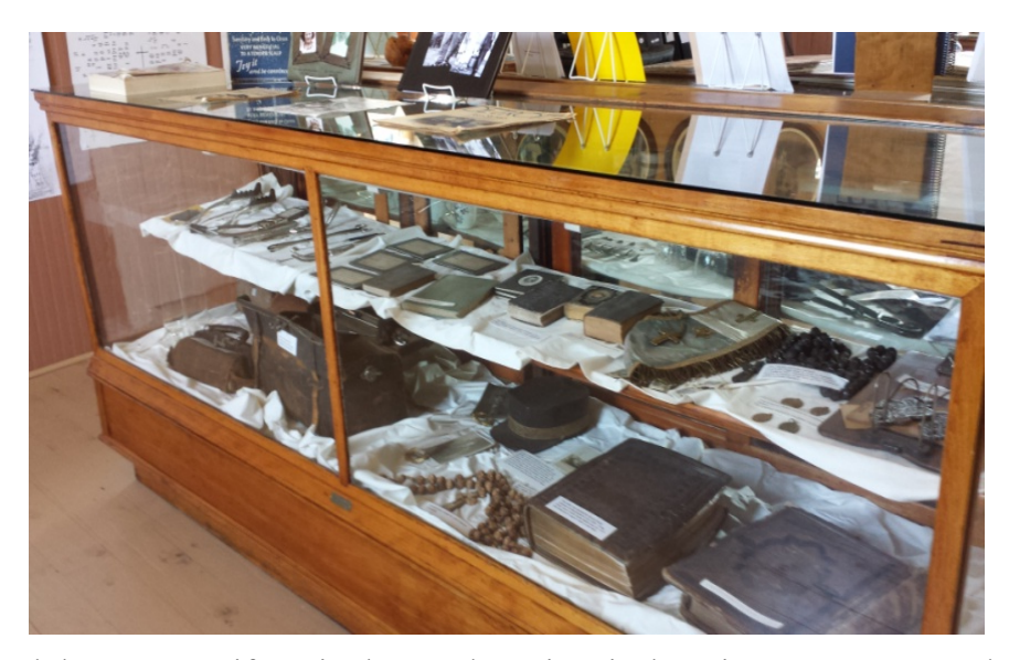
Figure 5. French language artifacts in the Garden Historical Society Museum, Garden, Michigan (2019).