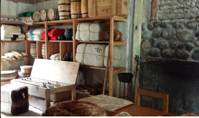
c) An interior of a reconstructed supply building at Fort Michilimackinac (above)

a) An exterior view of Fort Michilimackinac at the Northern point of the Lower Peninsula with Lake Michigan in the background (above)