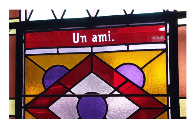
Figure 2b. A stained-glass window with French, Un Ami [a friend], in St. John's Catholic church in Garden.