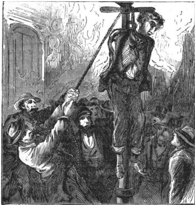
SWIFT JUSTICE. FATE OF THIEVES AND INCENDIARIES.

Figure 4. “Swift Justice. Fate of Thieves and Incendiaries.” Engraving. From Luzerne, Frank. The Lost City! Drama of the Fire-Fiend! – or – Chicago, As It Was, and As It Is! And Its Glorious Future! New York: Wells, 1872 p. 187.