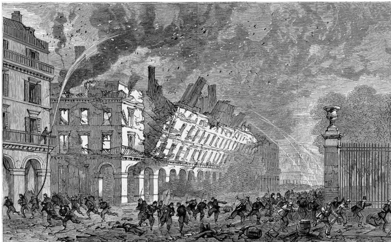
Figure 9: “The Burning of Paris – Fall of Houses in the Rue de Rivoli,” July 1, 1871, 596 Harper’s Weekly . Harpweek, https://content-harpweek-com.ezproxy4.library.arizona.edu/view/issue/image/1871/0701/596 (accessed 5/2/2022).

The imagery of arson in 1877 is strikingly similar to that of 1871 in Paris, which Harper’s Weekly also featured at length. Images of Pétroleuses – the accused perpetrators of arson – were common, but images of the burning itself were also well covered. One example is the woodcut “Fall of Houses in the Rue de Rivoli ” (Fig. 9). It shows the attempts to put out the fires of Paris in the Rue de Rivoli , which the Communards were accused of setting aflame. The large front part of the center building is illustrated in the process of falling spectacularly to the street below. The figures fleeing from the falling debris are