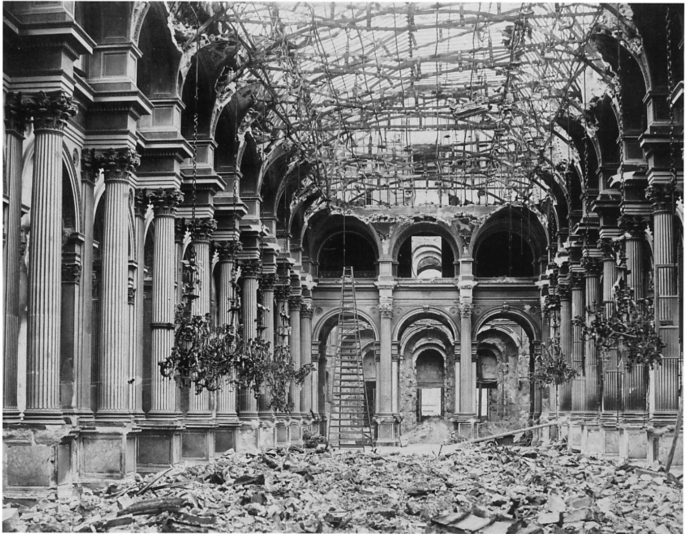
Figure 1. Andrieu. Désastres de la guerre: L'Hôtel-de-Ville, Galerie des Fêtes , 1871. École Nationale Supérieure des Beaux-Arts. From the essay "Creating Désastres: Andrieu's Photographs of Urban Ruins in the Paris of 1871," The Art Bulletin 80, no. 1 (1998).