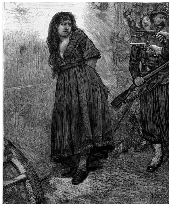
Figure 5. “The End of the Commune – Execution of a Pétroleuse ,” July 8, 1871, 628, Harper’s Weekly , harpweek, https://content-harpweek-com.ezproxy4.library.arizona.edu/view/issue/image/1871/0708/628 (accessed 4/19/22). 66