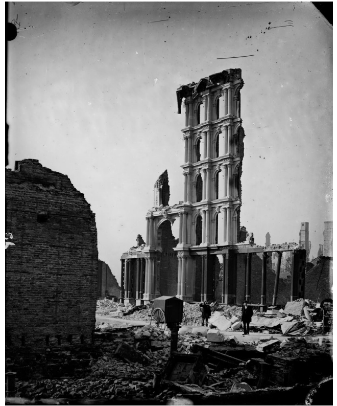
Figure 3. Jex Bardwell. Ruins of the Honoré Block after the Chicago Fire of 1871 . Photograph, glass negative. From Chicago History Museum: Images , ichi-059806. https://images.chicagohistory.org/asset/24045/ (accessed 4/19/22). 53