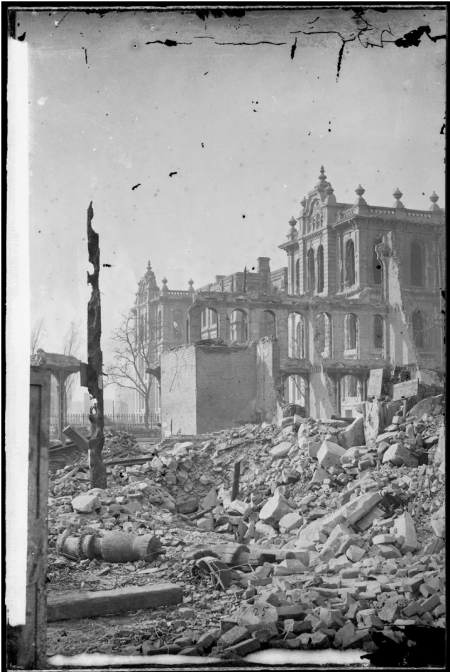
Figure 2. Jex Bardwell. Ruins of the Court House after the Fire of 1871 . Photograph. From The Great Chicago Fire & The Web of Memory , ichi-38923. https://gretchicagofire.org/item/ichi-38923/ (accessed 4/19/22).