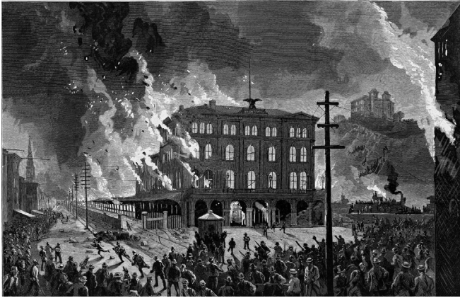
Figure 8: “The Great Strike – Destruction of the Union Depot and Hotel at Pittsburgh,” August 11, 1877, 621 Harper’s Weekly. Harpweek, https://content-harpweek-com.ezproxy4.library.arizona.edu/view/issue/image/1877/0811/621/m (accessed 5/2/2022).

conservative commentators to cast the Commune as uncivilized. A particularly poignant example came from a case on the first day of the Commune, when a group of Communards butchered and distributed the meat of a horse which was killed in the streets of Paris during the fighting. Commentators, particularly conservative historians, singled out women and children as the perpetrators, and used the ideological charge of the incident to condemn the Commune as uncivilized and barbaric. 94 Gullickson reads the incident as being ideologically important specifically because of the conflict between the