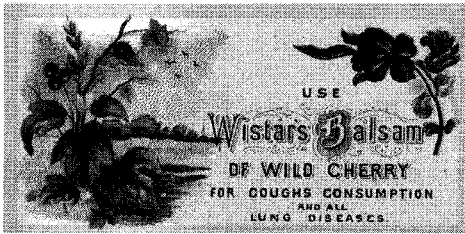
A trade card advertising the Wistar's Balsam of Wild Cherry (circa 1890).