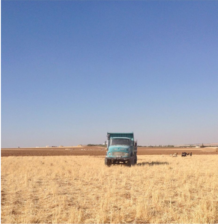
Figure 2. Land surrounding the church

I initially didn't bother, but after thirty to forty-five minutes of waiting under a tent to shield us from the blistering summer sun, I inquired as to when the funeral was actually going to take place. That morning, a larger funeral had been held for Aziz at the St. Mary of Nazareth Church in Amman before his body was to eventually be transported to Madaba for his final burial and service that afternoon. As I looked around at the other faces sitting under the tent, I saw what I would eventually be told were family members, Jordanian politicians, and other key members of the Ba'ath Party. There were also a number of people with no connection whatsoever to Aziz.