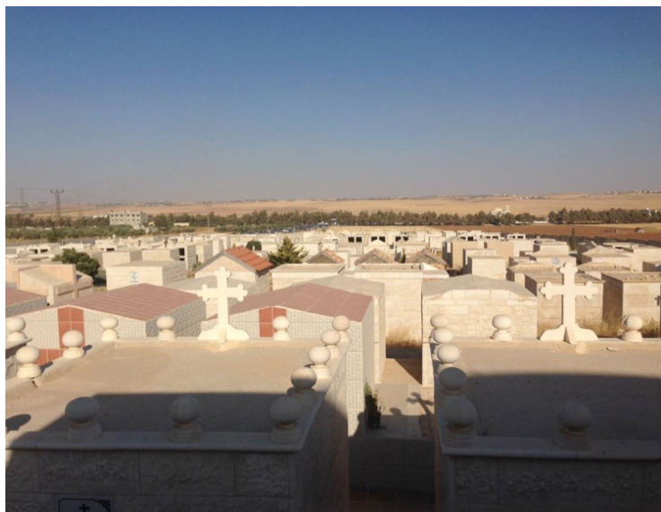
Figure 3. Church grounds

After having had enough of the cheap white plastic chairs that filled the area under the tent in the church courtyard, I stood up from my seat, wandering and looking out over the sea of mausoleums and graves surrounding the church. It wasn't lost on me that I was one of only a few foreigners there, aside from two foreign photojournalists. I was certainly the only American in attendance, which I came to feel quite acutely when chants sprung up denouncing the American invasion of Iraq that ultimately led to Aziz's capture and imprisonment, America's seemingly unwavering support of the Israeli government, and the tumultuous relationship between Iraq and Iran.