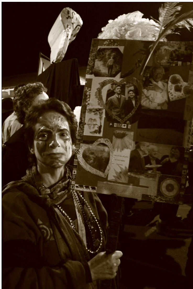
Figure 8: "It's two-sided.....Oh, how beautiful, thank you"