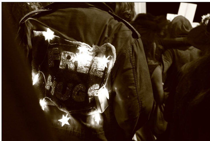
Figure 4: Shuffling forward, lighting the way