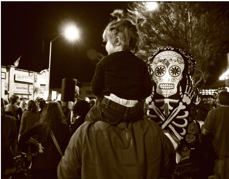
Figure 7: Pictures, face paint, flowers, candles, namesakes, keepsakes, heart-shaped love notes