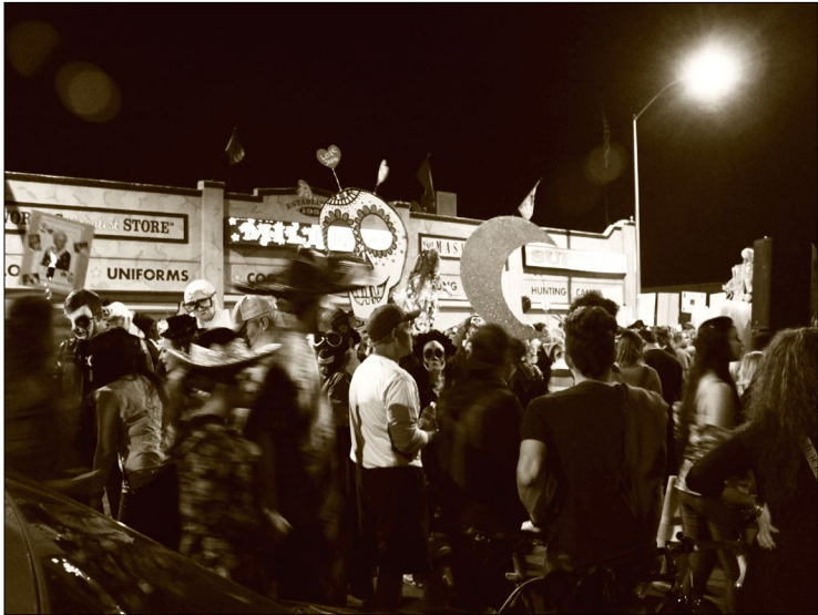
Figure 6: Gathering, looking, performing, listening