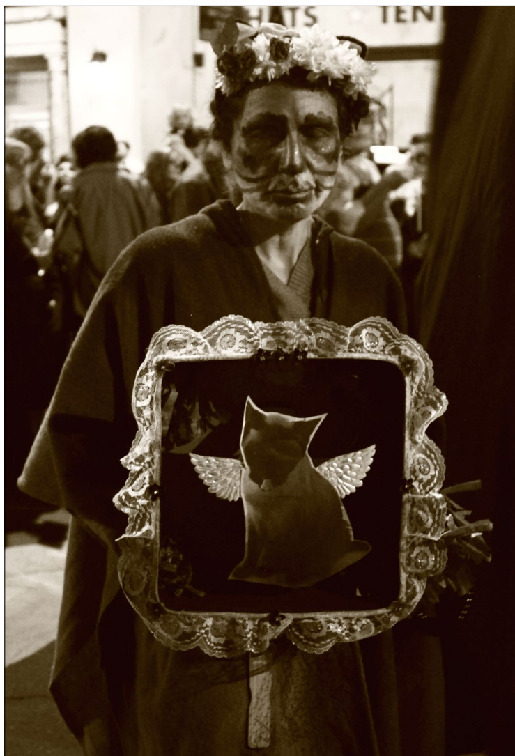
Figure 3: “Was that your cat? Yes...many, many cats...”