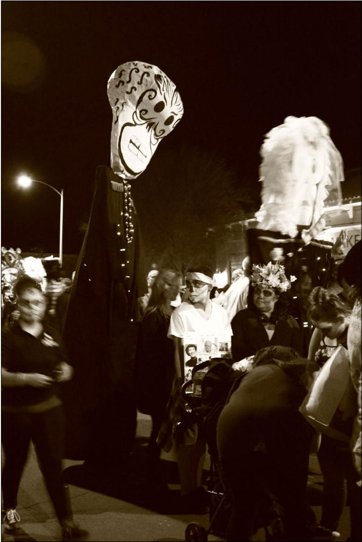
Figure 2: "Oh! I didn't realize someone was under there!"