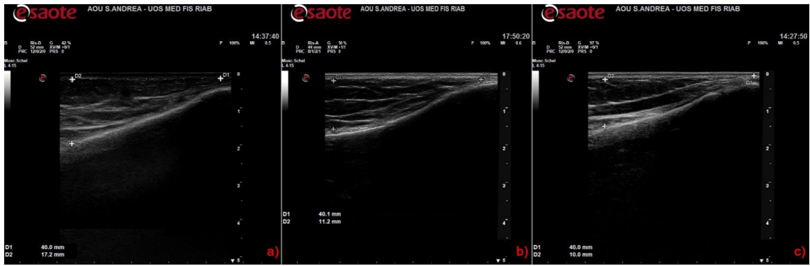
Fig. 1. Longitudinal ultrasonographic scan of the distal third of leg, at 4 cm from medial malleolus, (a) before treatment (T0), (b) at the end of treatment (T1), and (c) at 6 months after treatment (T3). Note that compared to the baseline (a) there is a reduction in SAT thickness (from 17.2 to 10.0 mm) and an improvement in the ultrasonographic pattern at T1 (b) and T2 (c).

by the patients. The only observation was the occasional appearance of small hematomas at the injection points of mesotherapy, which disappeared within 24-72 hours.