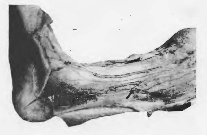
Fig. 3 Dissection specimen showing subcutaneous veins and lymphatics.

from one of the lymph trunks of the saphena media group and join the long saphenous vein at its junction with a communicating vein at mid-leg (Fig. 3, 4 and 5).