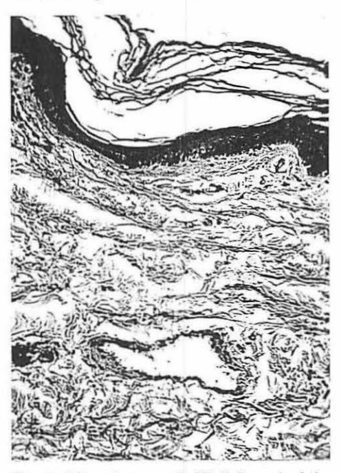
Fig. 7 Microphotograph (High Power) of the same case (Fig. 6) showing the dilated dermal "lymph vessel".

have shown a marked reduction in the web to femoral vein time in these cases. A detailed report on this work will be issued in a later report.