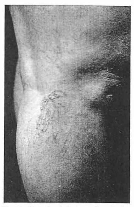
Fig. 6 Cuticular hair type of varix (female aged 47 years).

Though the precise mechanism for inducing function of lympho-venous communications is not vet established, some factors were stated to facilitate the demonstration of these communications, Pentecost (13) has shown that such communications become functionally significant after the ligation of all the lymphatics in the hind limb of dogs. An increased incidence of demonstrated lymphovenous shunts in the human was noticed in certain diseased states such as renal and hepatic disease as well as congestive heart failure (16, 6, 15, 18, 19). Also lymphovenous communications were demonstrable in conditions with extracellular fluid accumulation (19).