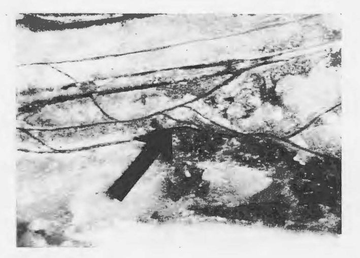
Fig. 4 Close up view of specimen shown in Fig. 3.

Fig. 3 Dissection specimen showing subcutaneous veins and lymphatics.