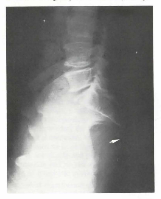
Fig. 3B Contrast medium lying in front of the sacrum. Post-operative film

become apparent a Hartmann's procedure had been performed, and therefore no histology of the injection site could be obtained. In the one case in which sufficient time had elapsed, and in which the rectum could be properly examined histologically there was early oleogra-