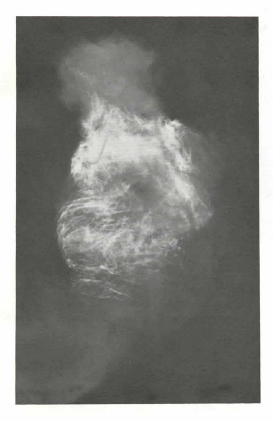
Fig. 1 Excised rectum with submucosal spread of the contrast medium

X-rays of the excised rectums showed the injected Lipiodol to be present in the tissues.