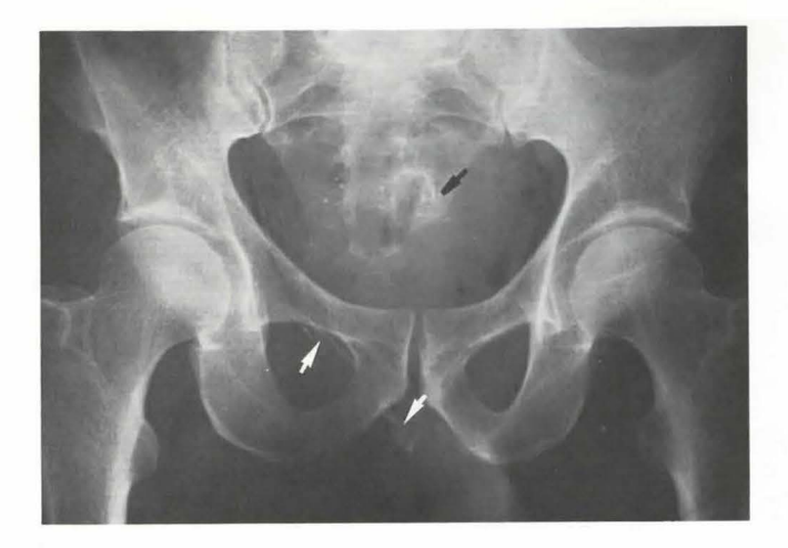
Fig. 3A Contrast medium lying pre-sacrally and along the upper border of levator ani. Post-operative film

become apparent a Hartmann's procedure had been performed, and therefore no histology of the injection site could be obtained. In the one case in which sufficient time had elapsed, and in which the rectum could be properly examined histologically there was early oleogra-