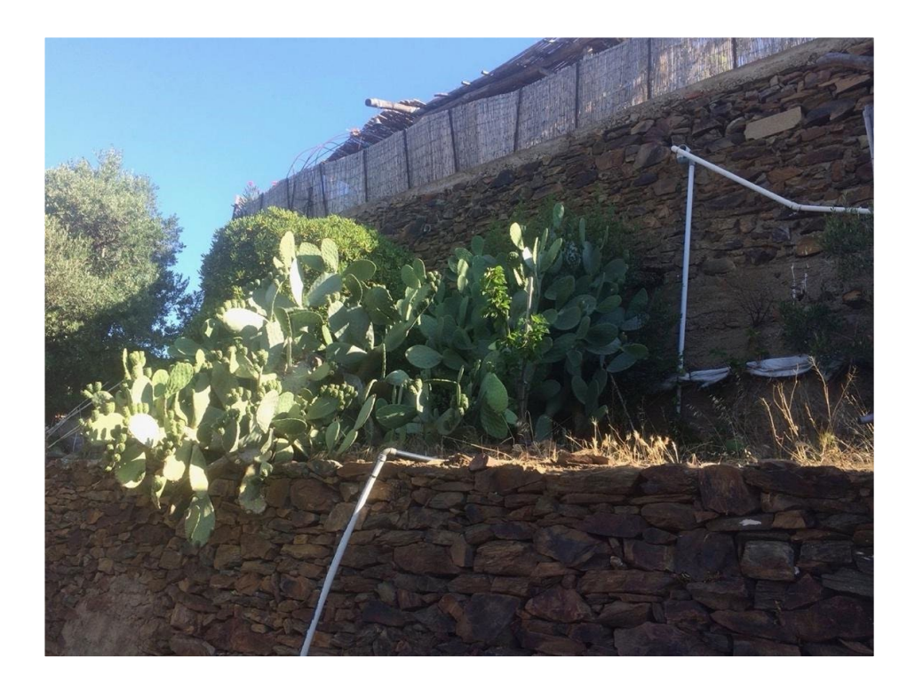
Figure 4: A cactus grove in Can Decreix.

become been recognized as viable alternatives to organic agriculture and were therefore arguably undergoing a process of 'majoritization.'