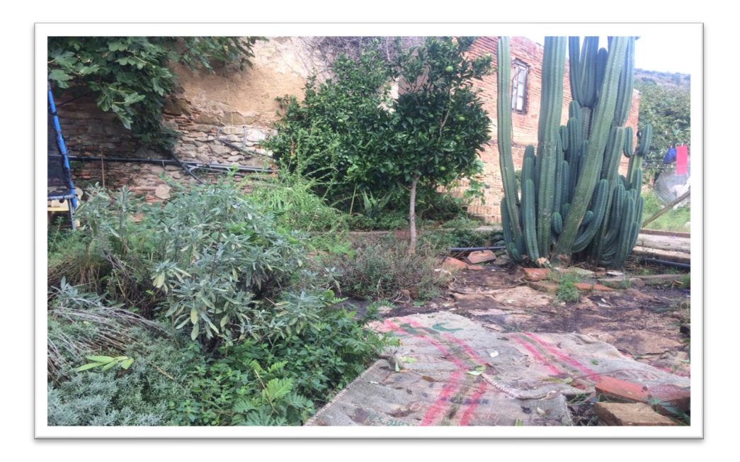
Figure 3: Rafael's experimental medicinal garden.

ended and non-deterministic way, with relatively little presumption about what the experiments and particular plants might do in a specific context. Rafael in particular, considered which particular plants may survive without any watering at all. He did so tentatively, allowing and anticipating vegetal failure, rather than trying to avoid it at all costs (see Marder, 2013, p. 98).