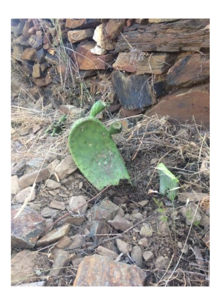
Figure 5: A cactus cladode that has just been planted.

Can Decreix experimented with 'domesticating' cacti, increasingly selecting for less spiky species. I participated for instance in "...a short training course in planting cacti for visitors, which very simply consisted in cutting off a cladode [the succulent leaf] and putting it two inches into the soil, and then adding water and compost" (Field Notes, 05/07/2018; see Figure 5). More than 'planting' wild plants like the cactus, we were "encouraged to rip out spikier 'wild' cactus and instead plant less spiky ones" (ibid.).