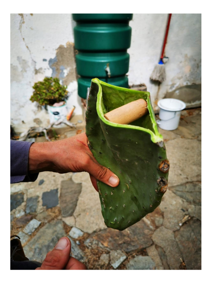
Figure 6: A cactus 'cup.'

During the cactus fest, a strong emphasis on 'play' and 'conviviality' stood out, with the cactus fest described as "a first convivial and playful encounter with the cactus opuntia." Visitors generally were invited to "come here and try a bit. Play the game. Try a bit and be surprised" (Luc). Next to demonstrating cactus, the cactus fest was also a space for participants to take part in a 'cacti-cuisine', making salad out of the cladodes and cactus crème, sterilizing the fruits in solar ovens. Furthermore, in a 'Cacti-DIY' session, cacti were used to make shampoos, masks and cremes as well as cactus paper and sponges, with the website showing an image of a cactus 'cup' (Figure 6).