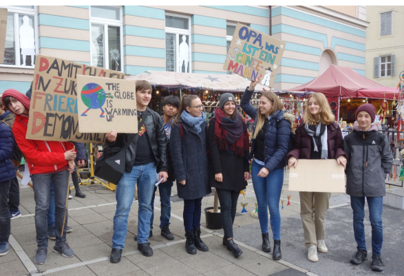
Figure 2 (left): FFF climate strike on 29 November 2019 in Graz (source: author, 2019) Figure 3 (right): Secondary students and trainee teachers with their posters at the beginning of the climate strike (source: author, 2019)

When students skip school to participate in a climate strike, it is interesting to question how parents react. Do they support such behaviour? I will now move to a discussion of some parental comments.