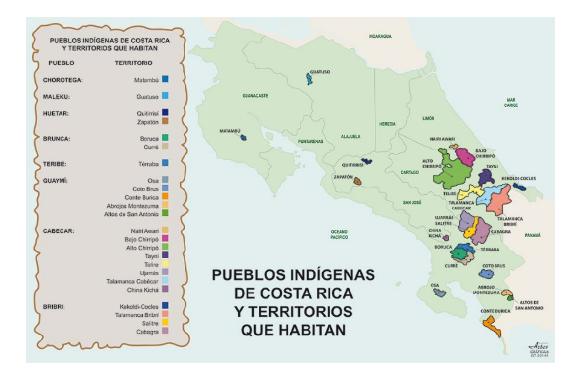
Figure 2: Location of Indigenous territories throughout Costa Rica. Térraba is visible in navy blue, underlined in red, in the lower, southern section of the country next to Boruca in green.

This article is the result of multi-sited, mixed-methods research conducted for 14 months between 2016-2020 in Costa Rica (where climate policies are enacted) and at international climate and hydropower meetings (where climate policies are orchestrated). My primary field site was Térraba, a 9,355 hectare legally designated Indigenous territory (established in 1956) located in the Buenos Aires municipal district of Puntarenas province in southwestern Costa Rica (Figure 2). Térraba is the ancestral homeland of the Brörán peoples, approximately 600 of whom reside in the territory alongside roughly 1,200 non-Indigenous peoples. The territory is bordered on its eastern and southern sides by the Térraba River, the longest and one of the last undammed rivers in the country. The river swells seasonally with five meters of annual rainfall, which flows down the steep gradient of the Talamanca mountains, making it the ideal location for dam development. On its 160 kilometer journey to the Pacific Ocean, the Térraba winds past numerous small towns, seven Indigenous territories, and through the sprawling mangroves of the RAMSAR protected Térraba-Sierpe National Wetlands. While in Térraba, I conducted interviews with community members, participant observation, and social-ecological research (vegetation transects and avian surveys) to understand peoples' knowledges of and relations with nature, and thus their reasons for resisting certain forms of development.