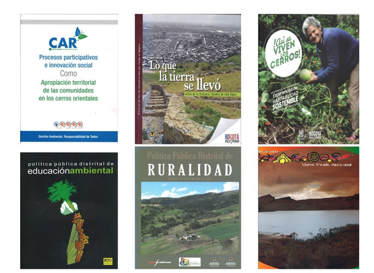
Figure 3: Documents reporting joint work between government institutions and civic organizations.