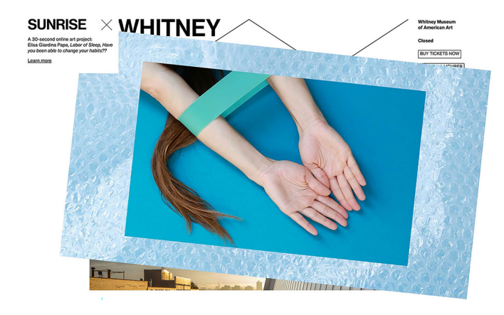
Figure 2. Screenshot of "Labor of Sleep: Have you been able to change your habits??", Elisa Giardina Papa, 2017. Still frame from video. Commissioned by the Whitney Museum of American Art. Courtesy of the Artist.

As an example of these partial disruptions, Elisa Giardina Papa's Labor of Sleep: Have you been able to change your habits?? (2017) in the Whitney Museum's Sunrise/Sunset project offers a compelling model for students' understanding (see Figure 2).11 By taking over the Whitney Museum's website and blocking the main webpage with her video art, Giardina Papa emphasizes how people use technology to control their sleep patterns in accordance with the cycles of a larger societal system (Giardina Papa, n.d.). Her work critiques the irrational aspects of technology-based self-optimization, which transforms even sleep into labor (Whitney Museum, n.d.). Her critique becomes more impactful as her work blocks the museum's website design. This act of redaction invites visitors to contemplate museum websites as technologyinfused built environments of their own, to which individuals must often adapt.