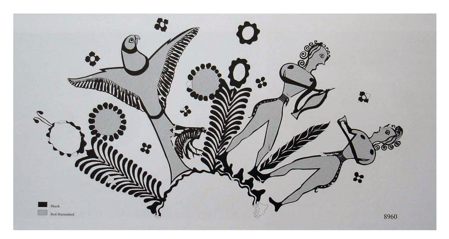
Figure 3: Drawing of the whole scene on jug 8960, Akrotiri, Thera (after: Papagiannopoulou 2008, 442, Figure 40.20)

sun movement in the sky.<sup>18</sup> Following his argument, falcon and sun may be considered as identical concepts.