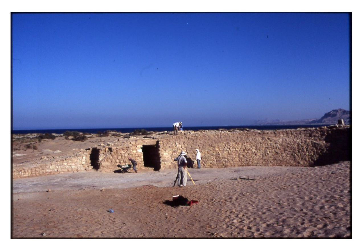
Figure 2: 2004 excavations of an Old Kingdom fort at Ras Budran