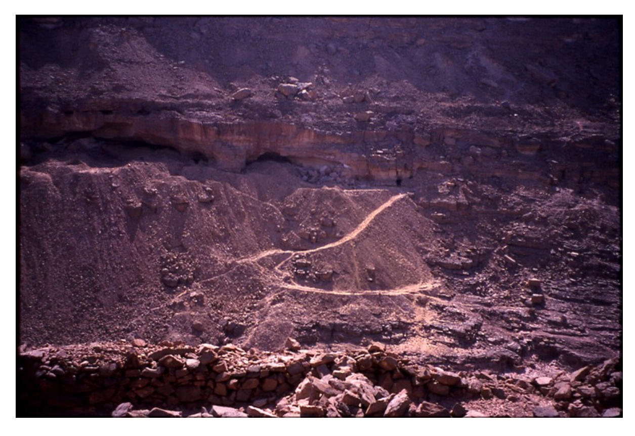
Figure 3: Middle Kingdom camp and mines in Wadi Maghara