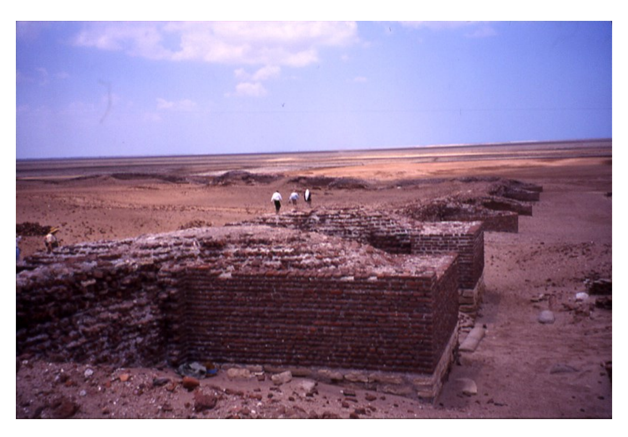
Figure 5: Roman Period fort at Pelusium

satellite sites in northwest Sinai, finding a Second Intermediate Period fort below a massive New Kingdom fortified town (at least 300 by 400 m), while the New Kingdom levels have yielded an inscribed block identifying the site with New Kingdom Tjaru. Tell Heboua, with its neighboring, crocodile infested marshland/lagoons, its specific topography and layout (e.g., a natural causeway spanning a western and eastern coastal lagoon), and a nearby coastline during the New Kingdom, parallel other known features identifying it with Tjaru and Sety I's depiction of the 'dividing waters' (Ta-denit) at Karnak Temple.<sup>109</sup> To the southeast, Hoffmeier's 1999-2007 investigations at Tell Borg<sup>110</sup> have traced the remains of a New Kingdom settlement, part of a probable temple, an associated cemetery, and two phases of fortifications (with baked brick and stone-lined moats) spanning late Dynasty 18 to the Ramesside period. 111 Regarding other recent, and significant New Kingdom discoveries, in 2012 a pair of rock-cut cartouches of Ramesses III was found at Abu Gada, 125 km to the southeast of Suez,112 along the Darb el-Hajj trail to Aqaba (see below for the section on the Negev).