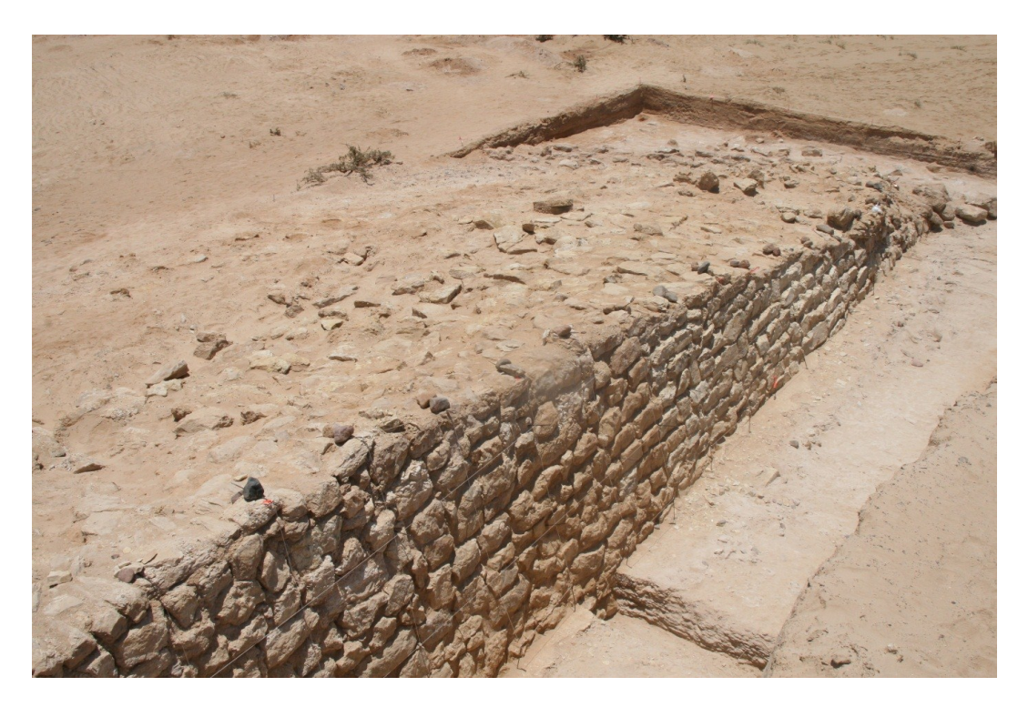
Figure 12: 2008 excavation of the fort's western "buttress" (or quay)