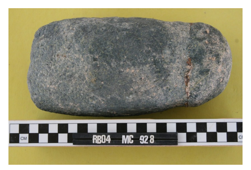
Figure 6: Hammer stone associated with stone debris from dismantling fort wall