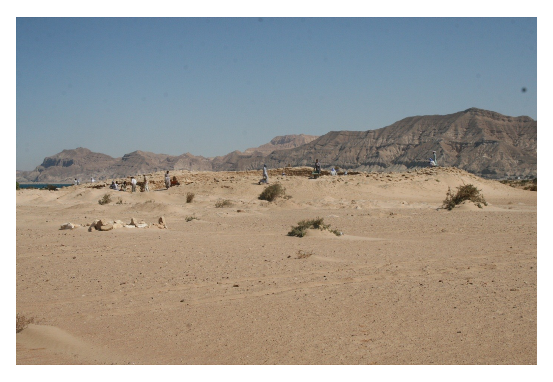
Figure 10: Looking north at fort, Red Sea, and mountains bounding Markha Plain