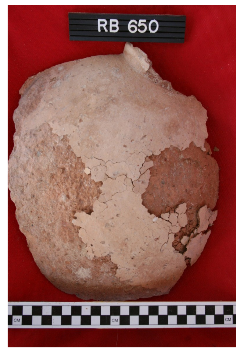
Figure 7: Late Old Kingdom storage jar fragment RB no. 650