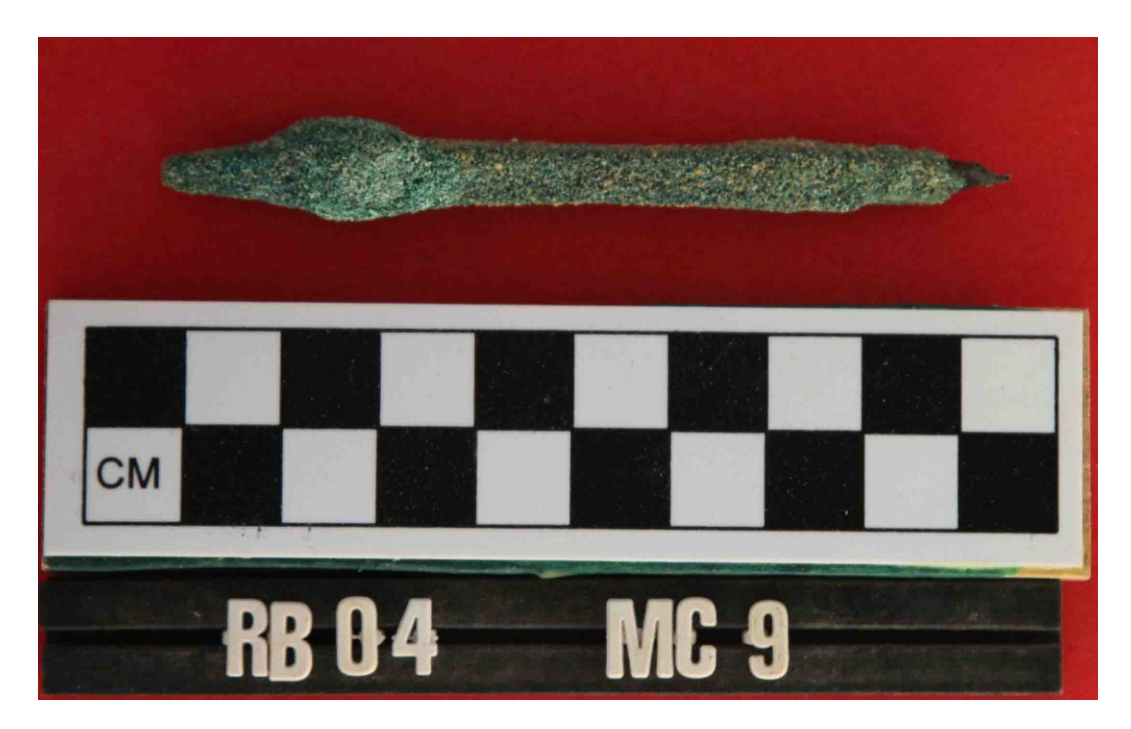
Figure 9: Late Old Kingdom copper alloy mortise chisel fragment MC no. 9