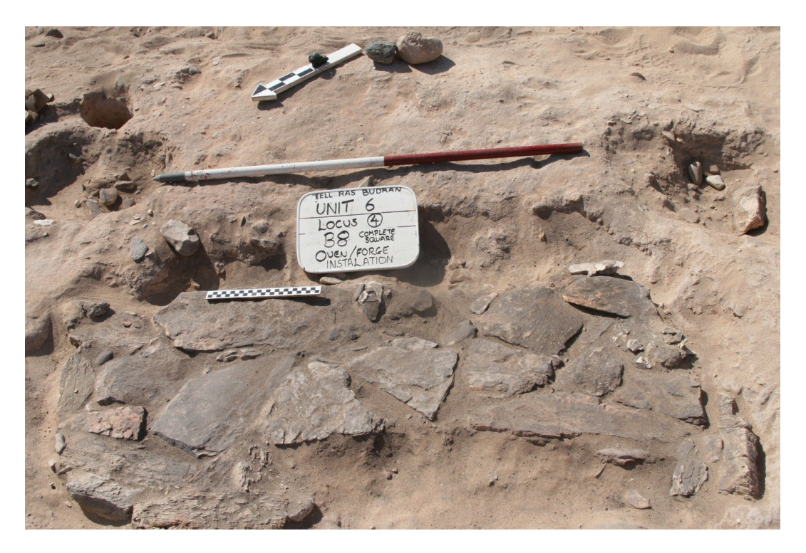
Figure 4: Stone paved baking installation in SE Quadrant (Unit 6), B8, locus 6