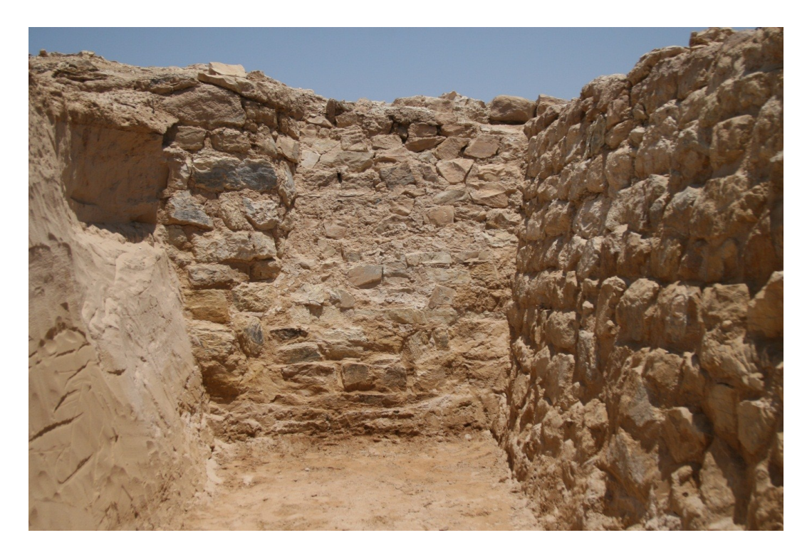
Figure 13: Exterior of blocked-up original entry passageway to the circular fort