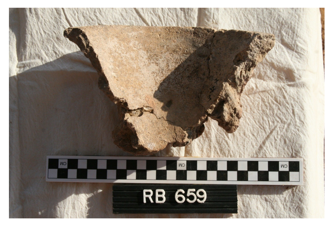
Figure 8: Late Old Kingdom bread mould fragment RB no. 659