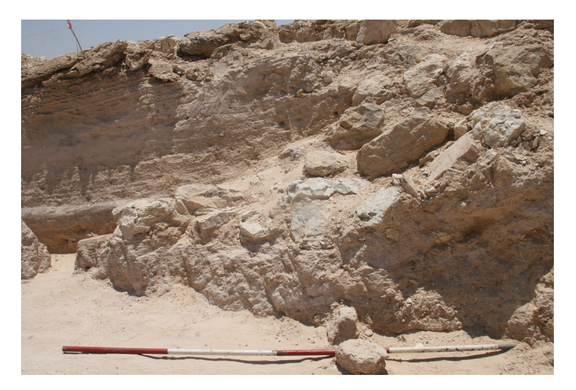
Figure 5: Blocks dislodged from wall in SE Quadrant Unit 6, Trench V/VI section