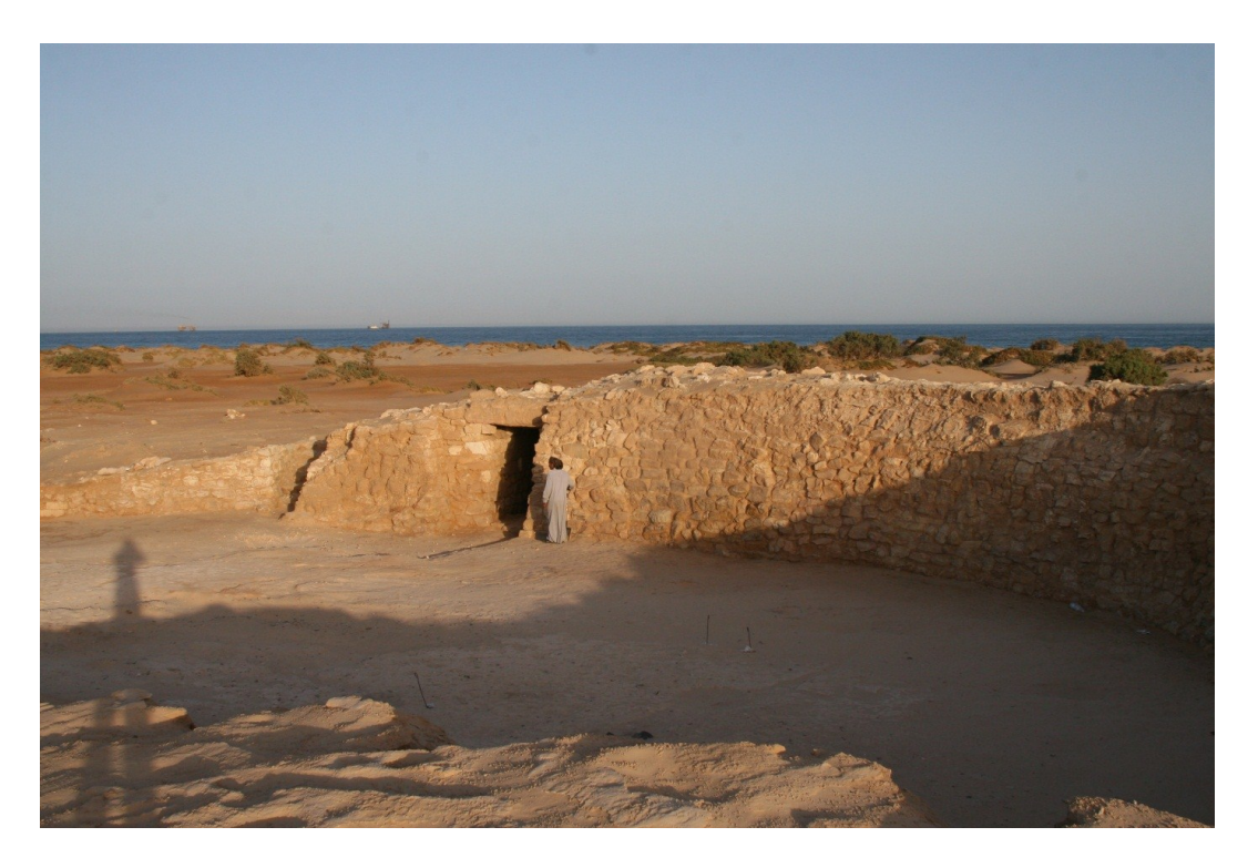
Figure 11: West side of courtyard with entry passage and stairway to battlements