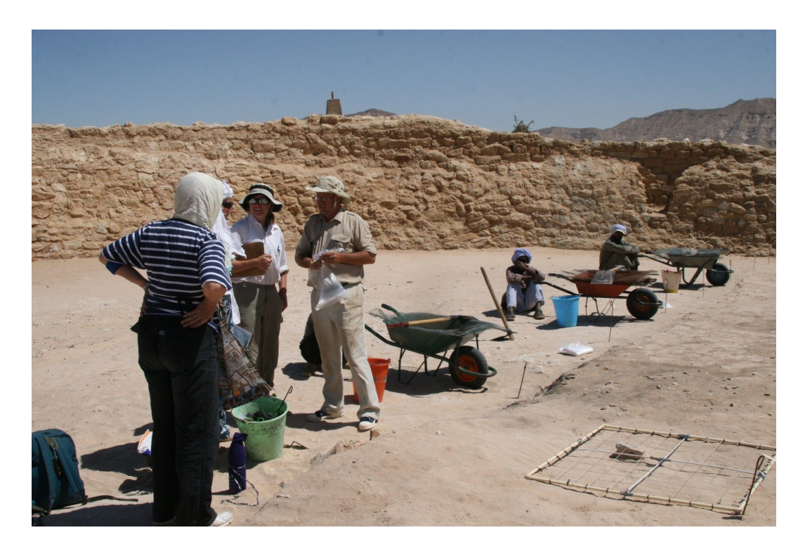
Figure 3: Sieving 1 x 1 m grid squares across the fort's upper occupation layer