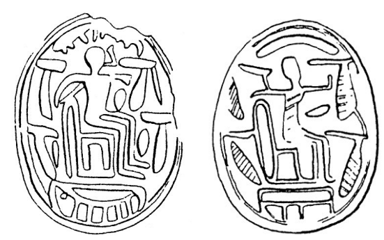
Figures 4 (Tel Zeror) and 5 (Gezer) (Schipper, Vermächtnis, 274, No. 4 and 8)

has drawn attention to a group of scarabs, which he calls the group of the "Eckig-stilisiert-Thronender" (that translates something like "the angled-styled-enthroned").<sup>49</sup> This Early Iron Age group is characterized by an iconography which on the one hand rests in an Egyptian tradition but on the other hand breaks with it. The scarabs of the group picked up one main motif of Egyptian iconography: the sitting pharaoh, as we find it on scarabs of the New Kingdom and also from the Third Intermediate Period: