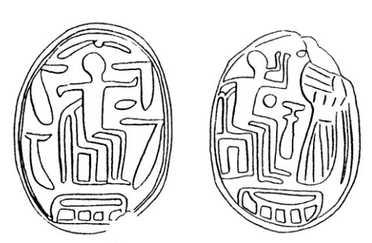
Figures 6 (Tell el-Ajjul) and 7 (Achzib) (Schipper, Vermächtnis, 274, No. 5 and 6)

Obviously, this iconography was adopted by the local scarabs, but the style and the design are quite un-Egyptian. The scarabs still show a sitting person, but without the symbols of a pharaoh. And we have also some hieroglyphic signs, like for instance the nbw -sign for gold, or the big one on the right side which is interpreted by Flinders Petrie as the nfr -sign, by Raphael Giveon as the dd -pillar and by Othmar Keel as the wdβ -sign (for the papyrus column).<sup>50</sup> What can be seen here too is a change of objects. For example, the uraeus of the original Egyptian scarab, where it is a part of the head, is now something protruding from the mouth of the enthroned. Objects of this group of scarabs were found in layers of the 11<sup>th</sup> to the 9<sup>th</sup> century (late Iron I up to Iron IIB). This documents on the one hand the constancy of