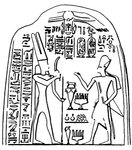
Figure 2: Scene from the Basalt Stele of Ramesses II (Schipper, Vermächtnis, 274, No. 1)

In the small temple of the 20<sup>th</sup> Dynasty a cylinder seal was found with an illustration showing Pharaoh Ramesses II (19<sup>th</sup> Dynasty). The style of the presentation of the Pharaoh is close to the large monumental stele with Ramesses II in front of a deity. He wears the battle-crown and shoots two arrows at the enemies. On the other side there is a local, Syrian-Palestine deity giving the Pharaoh the ritual saber. If we follow the interpretation proposed by Othmar Keel and Christoph Uehlinger,<sup>35</sup> the small thing visible on the forehead is the head of a gazelle. This could be a hint that the Syrian god is Reshep, who was linked to Mekal, the