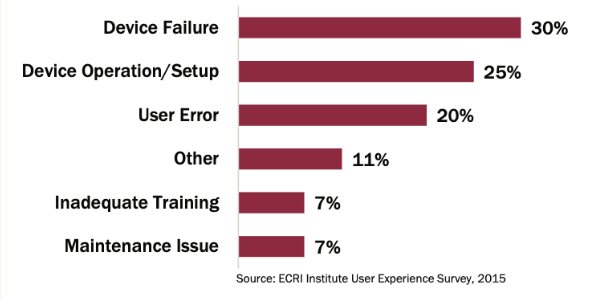
Fig. 1: ECRI Institute User Experience Survey, 2015

Many lawsuits have been brought against producers of these surgical robots. A lawsuit involving a robot-assisted surgery was brought in 2016 against Intuitive Surgical on the grounds of a failed surgery performed with their da Vinci Robot (Kaplan, 2016). The same article goes on to explain that the plaintiff claimed that the machine was the cause of her postoperative infection, but the performing surgeon claimed that the fault was on her for ignoring post-operation instructions. In this case, Intuitive Surgical settled with the plaintiff, but other lawsuits had been brought against Intuitive, claiming they withheld knowledge of the machine's malfunctions (Kaplan, 2016). One attorney claimed that "in less than 1 percent of cases, patients or doctors reported that the insulation covering the 'wrists' of the robotic arms cracked, allowing electricity to shoot out and burn the patient" (Kaplan, 2016). When producers of surgical machines are involved in robot-assisted surgeries, they assume liability and face consequences for under-developed and refined machinery, as demonstrated in these allegations.