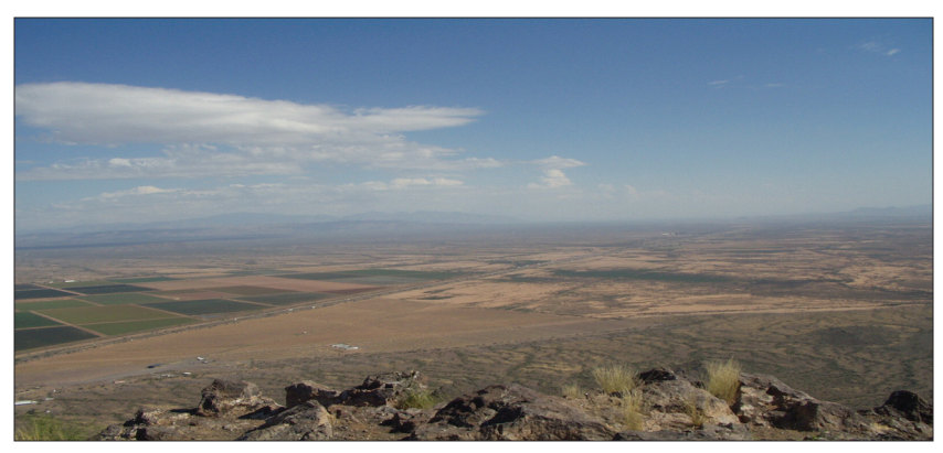
Figure 67: Photograph from Picacho Peak, Arizona, looking towards the southeast on October 8, 2005.